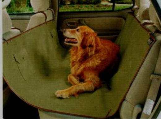
Among the more popular items for creating a safe riding environment are hammock-style seat covers, which create a contained space for the dog, combined with harnesses that buckle into the vehicle's seat belts.

traveling with many dogs. Matsumoto agrees that sometimes you can fit everything into a minivan or SUV, rather than a specially fitted van or truck, but he warns, "If you're working out of a confined area, packing that vehicle means you have to be very precise."